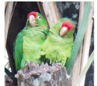
Parakeets at Wilson Botanical Gardens