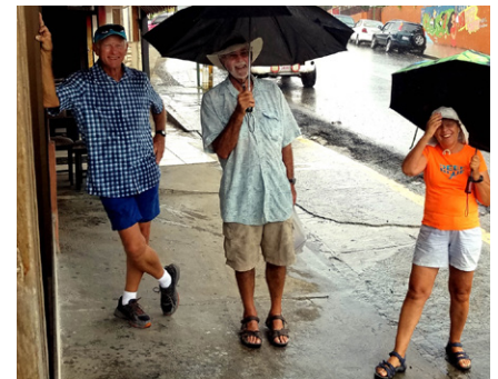
Rain in San Vito

birders) they were seeing. A wonderful breakfast every morning including fresh eggs from hens in a forest enclosure on the property, lots of fresh fruit and amazing homemade bread. One evening we had a delicious Costa Rican/Belgian dinner (the proprietors, Pepe and Kathleen, are a Costa Rican/Belgian couple). Two other evenings we put together dinners from a San Vito grocery store, and the staff very kindly put out all the dishes and utensils we would need, together with a loaf of their homemade bread.