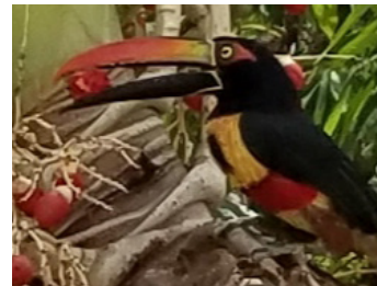
Fiery bill Aracari at Villas Alturas

When we got to the place, though, it was a right turn off the road (away from the ocean) and about a mile up a steep, rutted grade. Never mind, this resort is also a lovely place, with Toucans and Fiery Billed